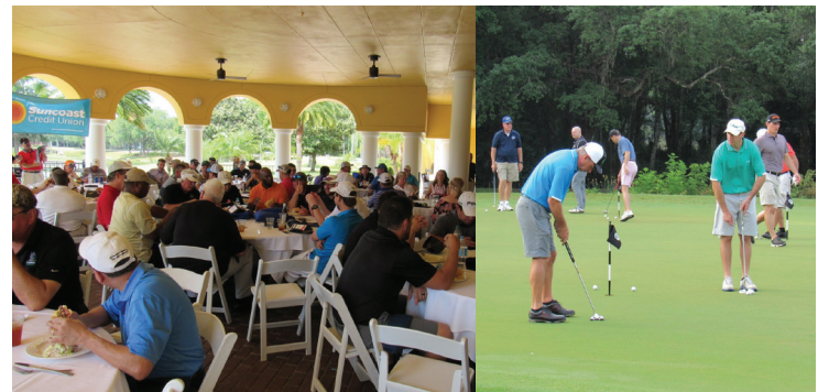
Wonderful turnout for our annual HCC Foundation Golf Classic. The Tournament netted $54,000 for Athletics, the most raised for this event to date.