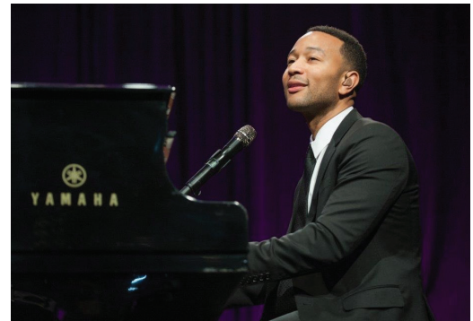
John Legend mesmerizes audience at annual BBCB Summit Lunch.