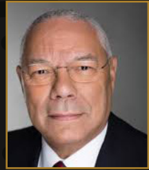
General Colin POWELL , USA (ret.)